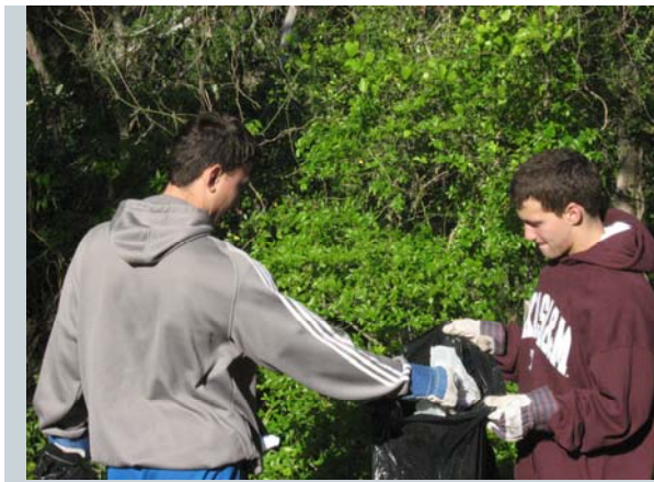
Volunteers at Terry Hershey Park , Trash Bash® 2009

This year, on March 27 the Bayou Preservation Association will be in two places at once for Trash Bash®. That's right. Instead of just focusing on Terry Hershey Park as we have done for the past three years, BPA will have volunteers on site at Collins Park on Cypress Creek in the northwest Houston/Spring area. Trash Bash® is an event held each spring where thousands of people gather along waterways in the Houston/Galveston area to clean up trash and debris. This year, 17 sites will participate, including Collins Park and Terry Hershey Park on Buffalo Bayou. BPA is the official host/coordinator for both locations.