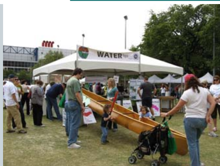
BPA Water Zone at the Earth Day Houston 2009

SWA Group on the layout, design and implementation of the area, along with